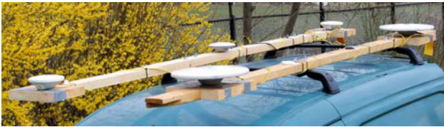
Fig. 1: The vehicle equipment used for the test. The three antennas on the bar on the left of the image are used for this experiment: at both ends a high-end D-GPS receiver for the ground truth and in the middle the mu-blox TIM LP GPS receiver used for the PPP-technique. The two receivers at the other bar are not relevant for this experiment.

All combined, the horizontal position of regular GPS positioning is accurate to approximately 5-10 m, and the vertical precision 10-20 m.